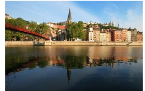
Lyon- Unesco World Heritage City